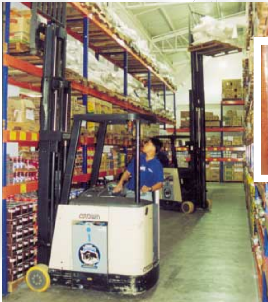
Below The Crown RC Forklifts are also used in PriceSmart's cold store.