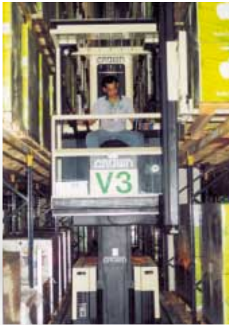
Left Four Crown Turret Trucks provide efficient pallet handling at all lift heights.

including the recently introduced WAVE (Work Assist Vehicle) low level orderpicker.