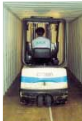
Below Crown's SC forklifts are ideal for loading and unloading containers.

The company operates one of the largest fleets of Crown equipment in Singapore,