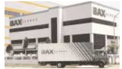
Top left Bax Global operates two logistics centres in Singapore.