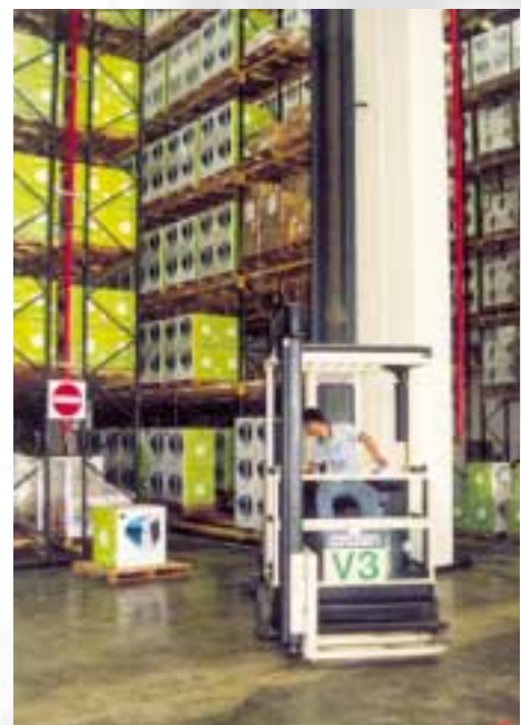
Above Turret Truck Stock Picker operators can change aisles quickly due to its free-ranging capability.

BAX Global’s customer base numbers around 10 major ‘blue chip’ clients, with volume typically growing at about 25-30% each year, with the exception of last year when it nearly doubled.