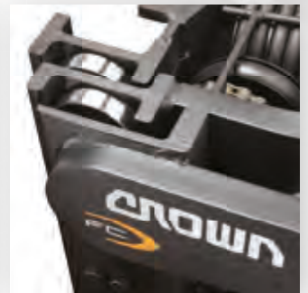
Built for Durability