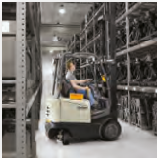
Easy to Manoeuvre

The Crown FC 5700 Series lift truck is ruggedly built with intuitive controls, a small turning radius and enhanced performance to allow operators to move heavy loads in congested areas and aisles with confidence and precision.