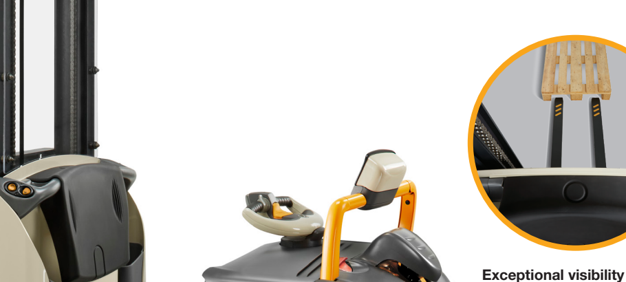
Exceptional visibility through the mast due to nested I-beam construction and a non-obstructive fork carriage.