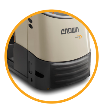
A 10-mm thick steel skirt and chassis, along with impact-resistant covers, provide robust protection in high-impact areas. Shown with optional rubber bumper.