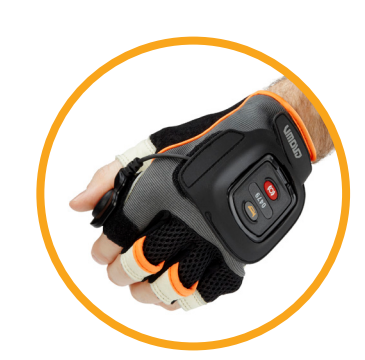
QuickPick Remote Order Picking Technology. For high-density order picking and fulfillment applications, Crown's QuickPick Remote is an operator assist technology that simplifies workflow.