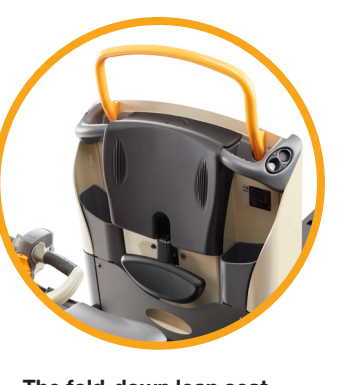
The fold-down lean seat provides postural relief for long travel distances to keep operators comfortable.

accessories can be adapted individually to the respective application area while enhancing user comfort, safety and productivity. For the installation of the accessories, two front Work Assist accessory tubes are available, one with and one without cable management.