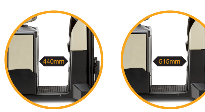
Small or large operator compartments give facilities more flexibility to match their user demographics.