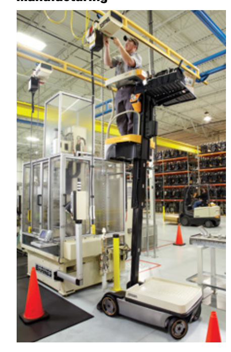
Distribution/Small Parts picking