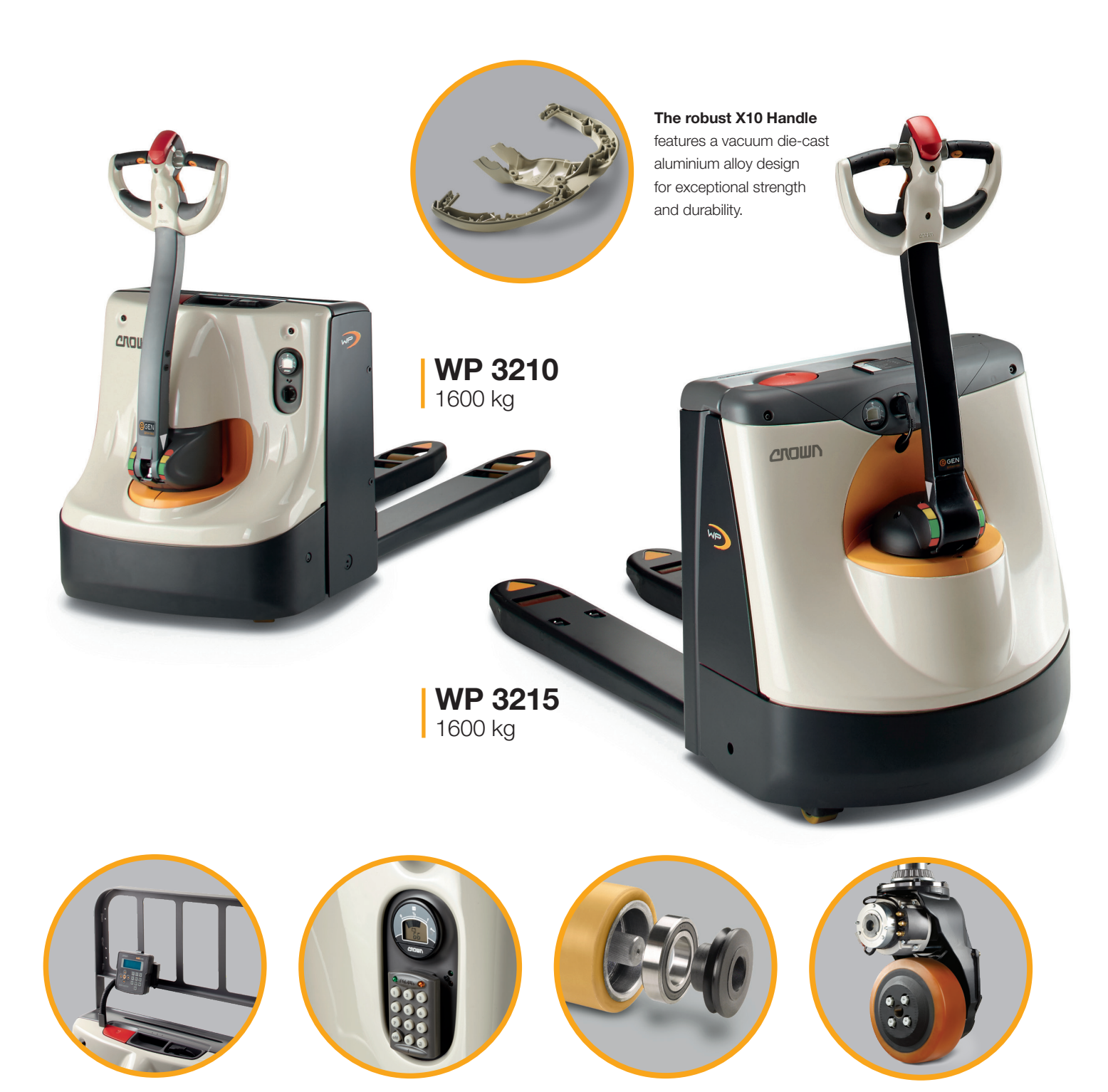
Access control via a key, keypad or swipe card keeps unauthorised people from operating the truck.

The Crown WP 3200 Series gives you options based on a powerful concept. Trucks designed to work well with people get the job done faster, easier, safer and more economically.