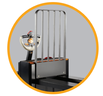
Load backrests (optional) are available in short or high versions to help stabilise loads.