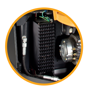
Optional high-frequency chargers are designed for reliable and efficient operation.