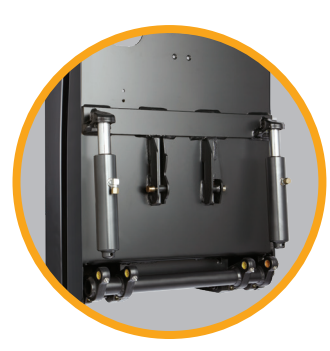
Dual lift cylinders (certain models only) coupled with a heavy-duty torsion bar eliminate chassis twist when handling offset loads.