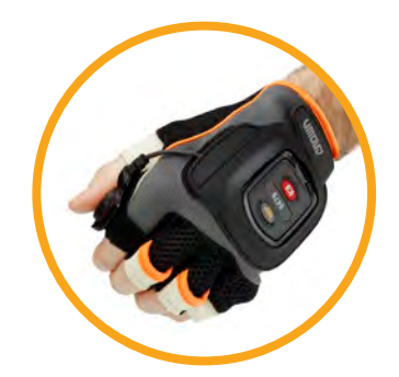
QuickPick® Remote Order Picking Technology. For high-density order picking and fulfillment applications, Crown's QuickPick Remote is an operator assist technology that simplifies workflow.