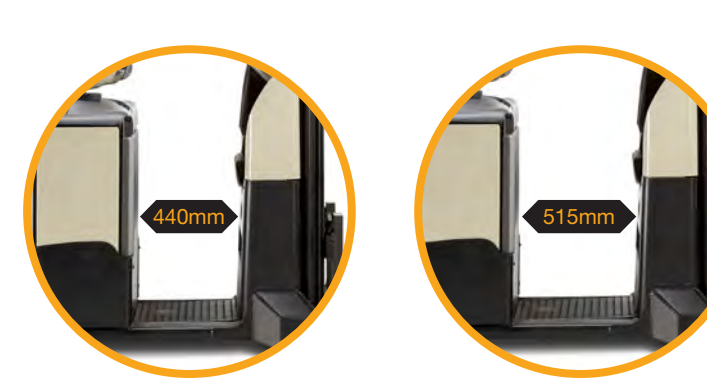
Small or large operator compartments give facilities more flexibility to match their user demographics.