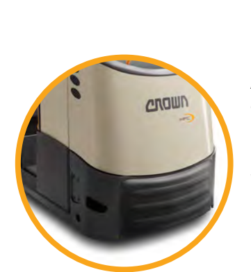
A 10-mm thick steel skirt and chassis, along with impactresistant covers, provide robust protection in high-impact areas. Shown with optional rubber bumper.