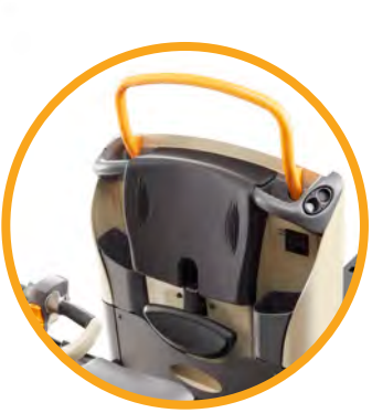
The fold-down lean seat provides postural relief for long travel distances to keep operators comfortable and help ensure exceptional performance.