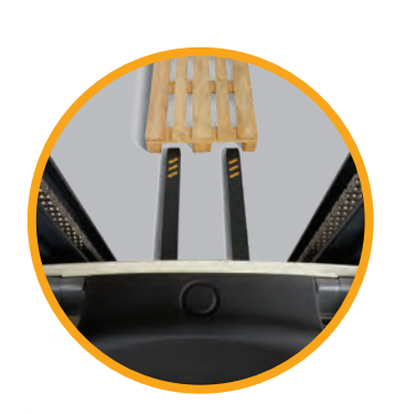
Visibility through the mast is first in class, due to nested I-beam construction and a fork carriage that minimises obstructions.