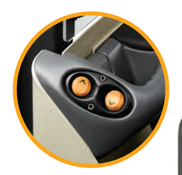
Optional lift/lower buttons on the backrest offer a better vantage point on or off the truck