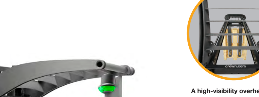
A high-visibility overhead guard gives operators a better view for positioning forks and loads at heights.