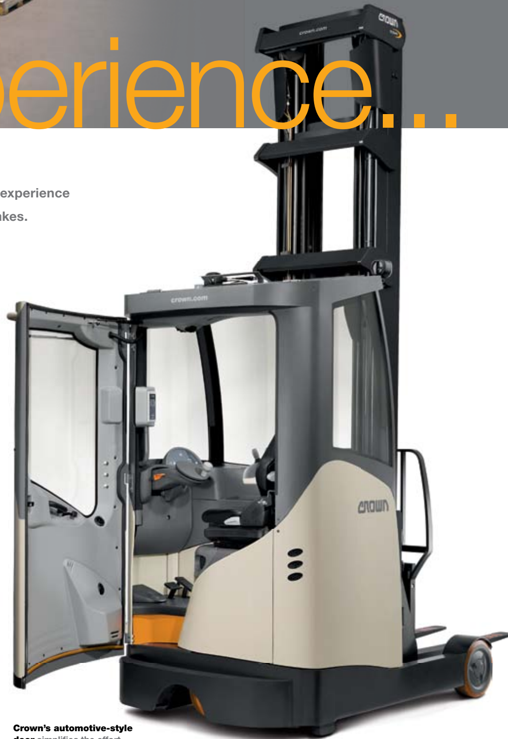
Crown's automotive-style door simplifies the effort required to enter and exit the truck and, in addition, provides easy motor service access.

The motion is further simplified by a convenient step that Crown engineers positioned at the optimal height to assist you. It's a difference your operators will appreciate, whether they get in and out of the truck one or two times a shift or several times an hour.