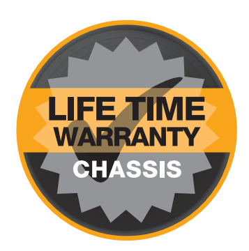
The robust steel structure of the chassis features a lifetime warranty. Durable steel covers further protect the internal components.