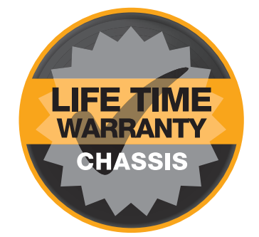
The robust steel structure of the chassis features a lifetime warranty. Durable steel covers further protect the internal components.