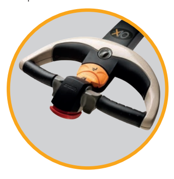
The robust X10<sup>®</sup> Handle features a vacuum die-cast aluminium alloy design for exceptional strength and durability.