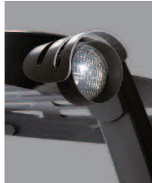
Overhead Guard Spotlight