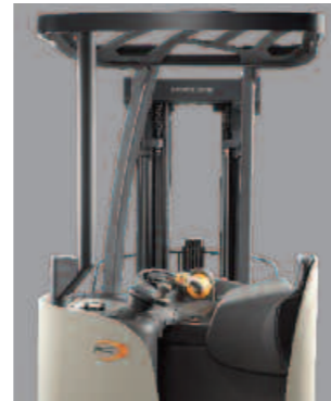
Drive-in Rack Overhead Guard