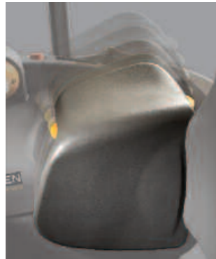
Five-position Adjustable Armrest

The Crown RC 5500 Series offers application-specific options to ensure that your lift truck meets the challenges and requirements of your work place.