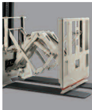
A Variety of Load-handling Attachments are Available