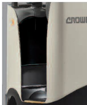
Operator Compartment Wall Padding