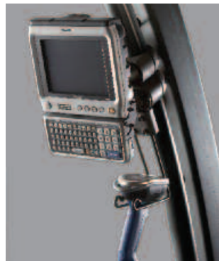
Work Assist™ Accessories include WMS Mounting Bracket, Clip Pad, Storage Hook, Storage Pocket and Dome Light.