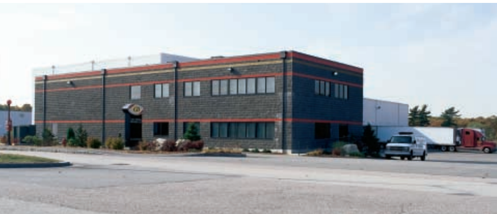
Newest Cara Donna Provision Company operation in Braintree, MA is shown above...The 38,000 square foot facility with freezer, cooler and dry goods storage serves customer in the New England market.

In the early 1980s, another expansion meant the purchase of another piece of material handling equipment – a Crown Series RC Stand-Up Counterbalanced lift truck. “That was a huge thing for us,” says Cara Donna. “We thought it was the best thing in the world since sliced bread.”