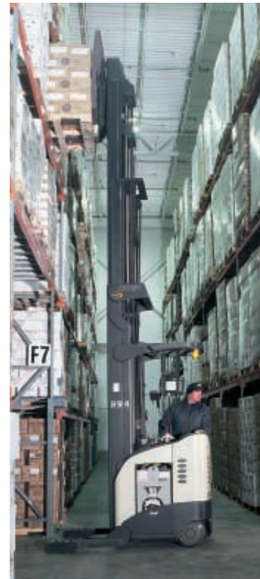
A Cara Donna Provision Company worker puts the Crown 5200 Series Reach Truck through its paces in the company’s frigid freezer application. Operators express a strong loyalty for the Crown products especially the 5200’s ability to work in a tough environment.

As they were learning, the business again evolved. Supermarkets were emerging and dominating the retail business. The company shifted its focus to more specialized products like Italian deli meats, cheeses and related provisions. When the pizza revolution arrived, the company’s distribution business reached new heights and into a new dimension – palletized loads.