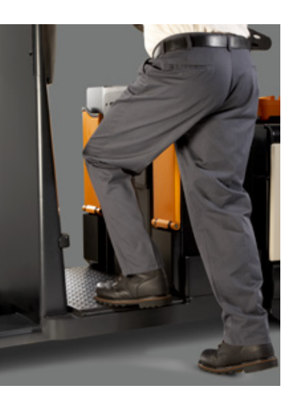
The platform on the PC 4500 Series stops at a preset height every time the forks are raised to provide a consistent step height for operators.

Given this fact, one of the main goals of the PC 4500 is to reduce operator efforts on and off the truck.