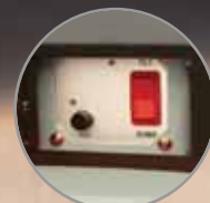
one touch tilting cabin switch