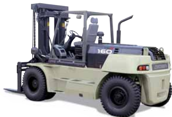
CD110 / CD130 / CD160S-5 11,000 kg, 13,000 kg, 16,000 kg Diesel, Pneumatic Tire