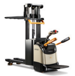
DS/DT Series Double Stacker