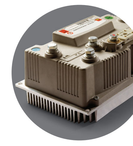
A CAN-bus controller, sealed for protection from dust and water, reduces wiring and improves reliability.