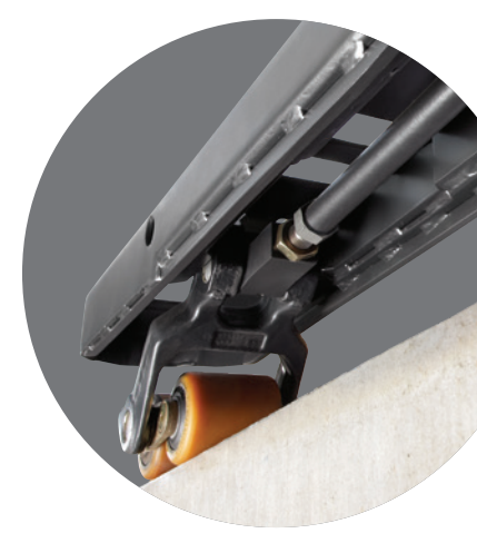
One-piece high tensile steel forks are formed into a C-channel and reinforced in critical areas. An adjustable pull-rod lift linkage eliminates buckling forces and elevates the riser axle for protection.