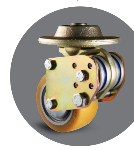
Shock-absorbing casters with lifetime torsion springs reduce impacts to the chassis and extend caster life.