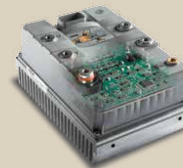
Access123 ® Comprehensive System Control

Factor in standard power steering and intuitive controls, and the SP 3500 Four-Point Series takes the operator experience to a new level of performance.