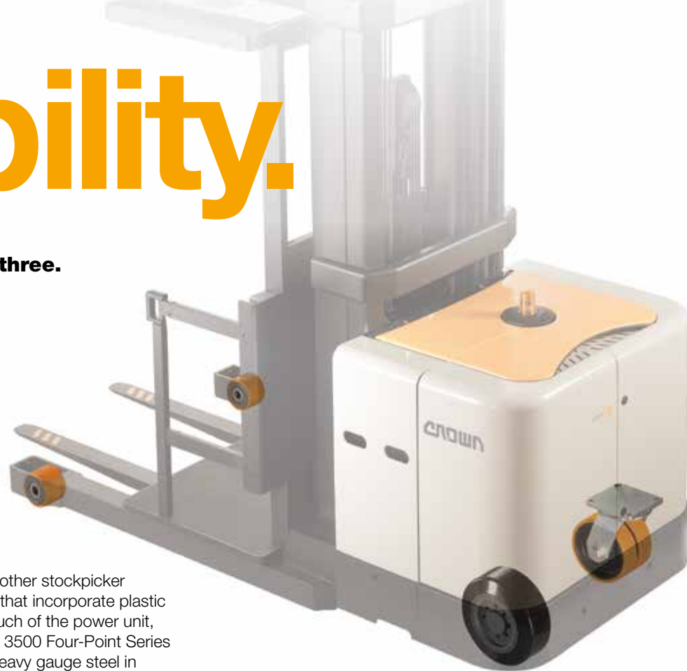
Four solid wheels on the ground provide a firm foundation for handling long, bulky loads.

Unlike other stockpicker trucks that incorporate plastic into much of the power unit, the SP 3500 Four-Point Series uses heavy gauge steel in the skirt, doors and battery cover. This additional weight, combined with the heavy-duty mast, gives the SP 3500 Four-Point Series substantial weight capacity advantages at height and further contributes to superior stability.