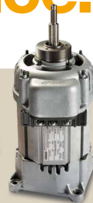
Crown-manufactured AC motors, coupled with the intelligence of Access 1 2 3 technology, bring unparalleled durability and reliability - with a big-time warranty to prove it.

Crown's exclusive Access 1 2 3 system control monitors key faster, simpler and higher quality diagnostics by following a logical, easy-to-understand troubleshooting process.