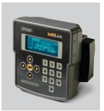
InfoLink<sup>®</sup> Operator & Fleet Management