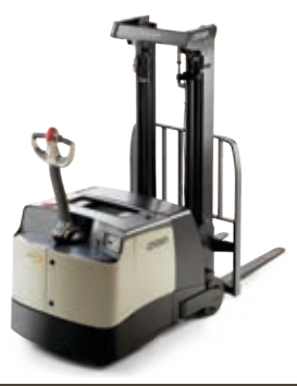
The SHC offers exceptional sightlines directly to the fork tips, which improves load handling and positioning at floor level and at height.

Capacity: 1,130 kg, 1,360 kg, 1,810 kg Lift heights: 2,895 mm to 4,365 mm