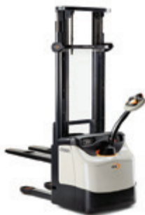
ES/ESi Series Pedestrian Stacker