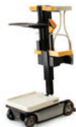
WAV Series Work Assist Vehicle