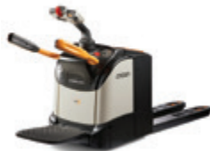
WT Series Powered Pallet Truck