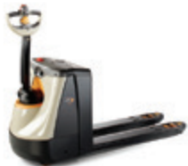
WP Series Powered Pallet Truck