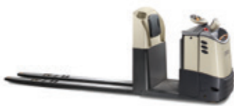
GPC Series Low-level Order Picker