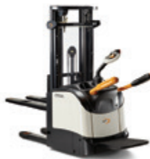
ET/ETi Series Platform Stacker