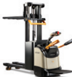
DS/DT Series Double Stacker