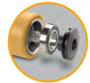
Debris guards prevent stretch wrap, plastic strapping and packing tape from building up around the axle and damaging wheels and bearings.