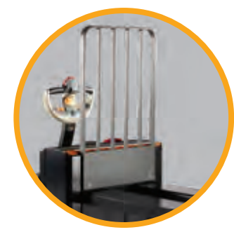
Load backrests (optional) are available in short or high versions to help stabilise loads.