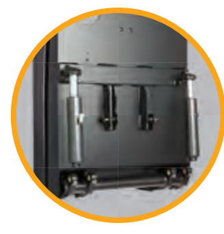
Dual lift cylinders (certain models only) coupled with a heavy-duty torsion bar eliminate chassis twist when handling offset loads.