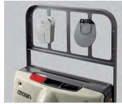
Load Backrest with Work Assist Accessories

The design of the WP 3210 makes it an ideal choice to travel with the lorry. The truck fits exactly in the space remaining at the back of a loaded lorry, or in under-lorry storage boxes. Designed with an operating range of -15°C to 40°C, the WP 3210 can safely stay on the lorry overnight. Long service intervals with minimal maintenance requirements keep it running reliably wherever it goes.