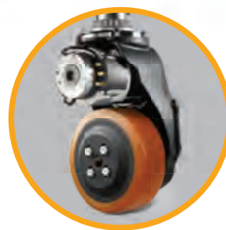
The intelligent e-GEN® Braking System uses the power of the AC motor to provide optimum levels of frictionless regenerative braking.