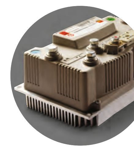
A CAN-bus controller, sealed for protection from dust and water, reduces wiring and improves reliability.