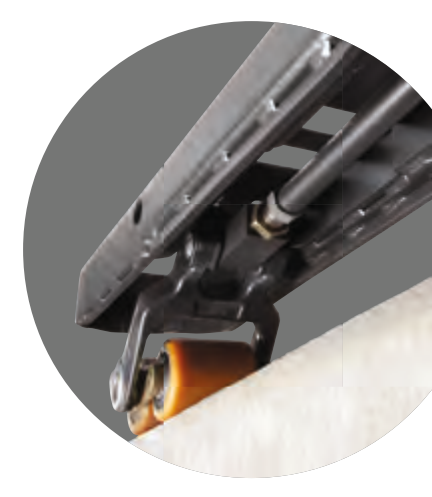
One-piece high tensile steel forks are formed into a C-channel and reinforced in critical areas. An adjustable pull-rod lift linkage eliminates buckling forces and elevates the riser axle for protection.