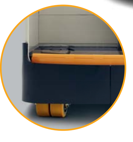
A suspended floorboard and spring-loaded castor wheels reduce shocks from dock boards and rough floors, offering best-in-class ride comfort.