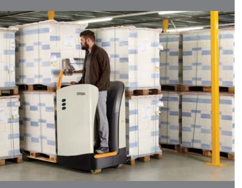
Manoeuvrability in Tight Spaces – Responsive steering, a narrow chassis and a short head length simplify work in tightly packed staging areas and narrow aisles, offering a considerable advantage when block stacking.