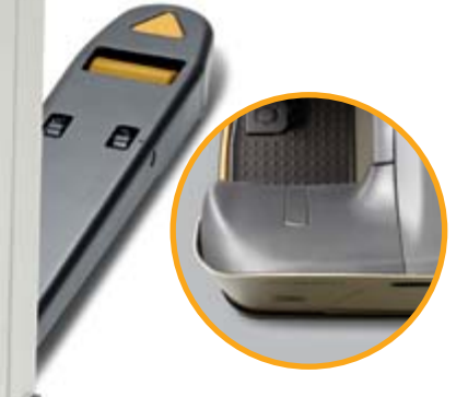
A wraparound soft foam lean pad, designed for operators of all sizes, provides extra comfort and support, particularly useful when operators lean back to gain better visibility.