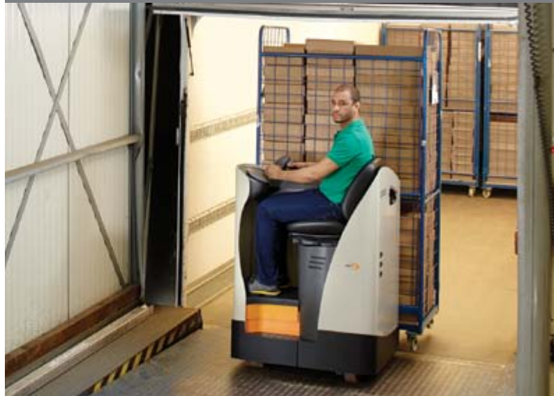
Versatility at Work – An efficient, compact operator compartment, matched with manoeuvrability enhancements, helps RT operators skillfully work around the dock and inside lorries.