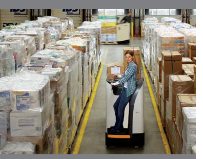
Transporter Excellence – Crown AC technology offers 12.5 km/h travel speeds and agile performance in congested areas and aisles, while the operator platform height enhances visibility.