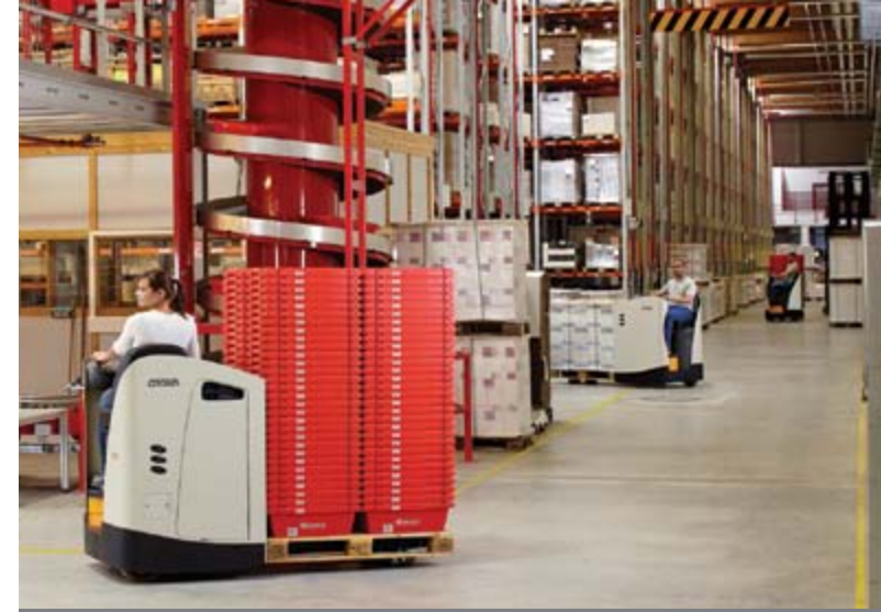
Seated Transport, Optimised – Fast-paced, mission-critical jobs require a truck that never lets up and a comfortable work space so the operator can keep going all shift long. The sit-down RT delivers with powerful acceleration, 12.5 km/h travel speeds , adjustable seat and floorboard and a higher seating position for better visibility all around.