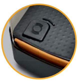
The patented Entry Bar Safety Switch deactivates travel if the operator places a foot outside the truck perimeter.

ensures that the truck brakes immediately when the operator takes his foot off of the pedal.