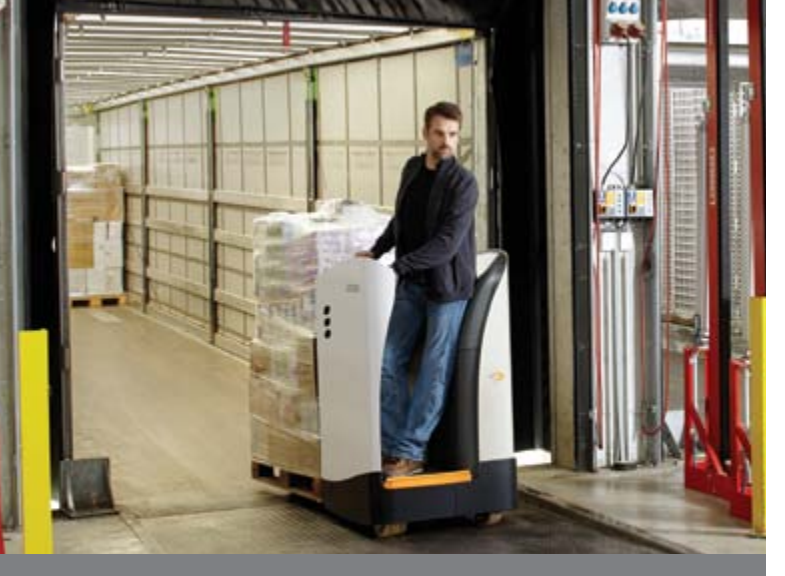
Faster Dock Work – Operators quickly move product into and out of lorries with the exceptionally manoeuvrable stand-up RT, featuring intuitive controls, a suspended floorboard and a chassis only 780 mm wide.