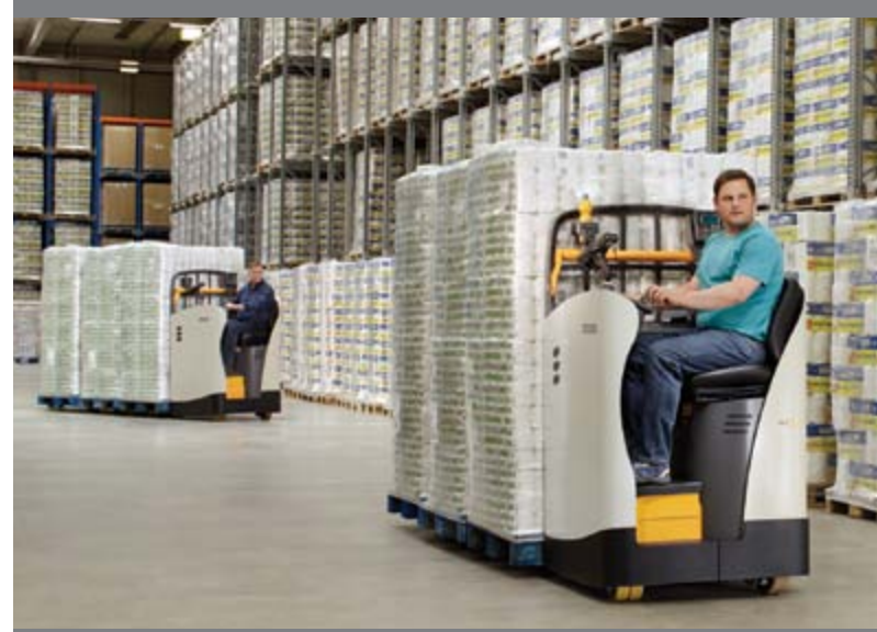
Move More – The sit-down RT is designed to excel in long-distance, high-throughput applications. When you need to move more product, the comfortable operator compartment and controls make this the right truck for the job.