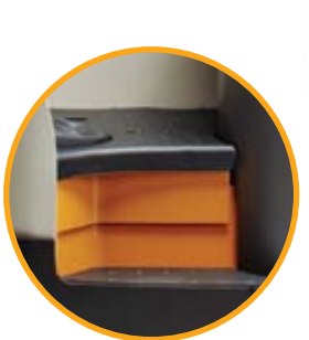
A height-adjustable floorboard provides 60 mm of travel so that operators can choose the precise position for optimal comfort.

is sized and positioned to minimise shoulder and arm stress in the most demanding applications.