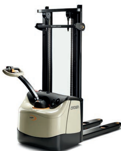
WF 3200 Series 1000 – 1200 kg