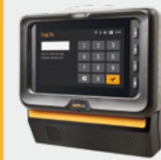
7" Touch Display