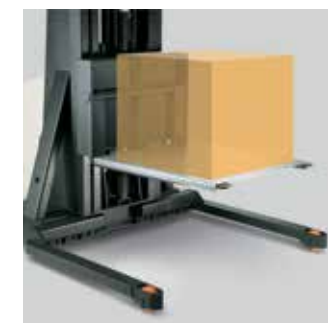
Snap on Platform