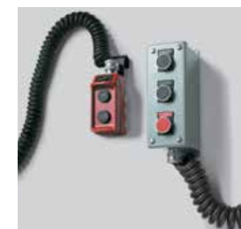
Remote Raise/Lower Controls