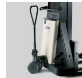
5th Wheel Steering