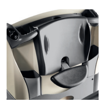
Adjustable lean seat