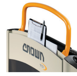
Additional rear storage compartment