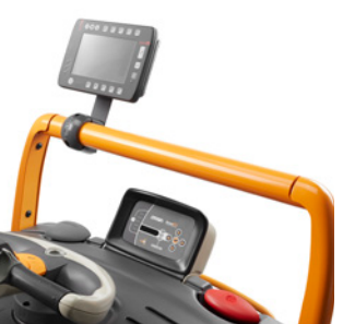
Front Work Assist accessory tube with cable management