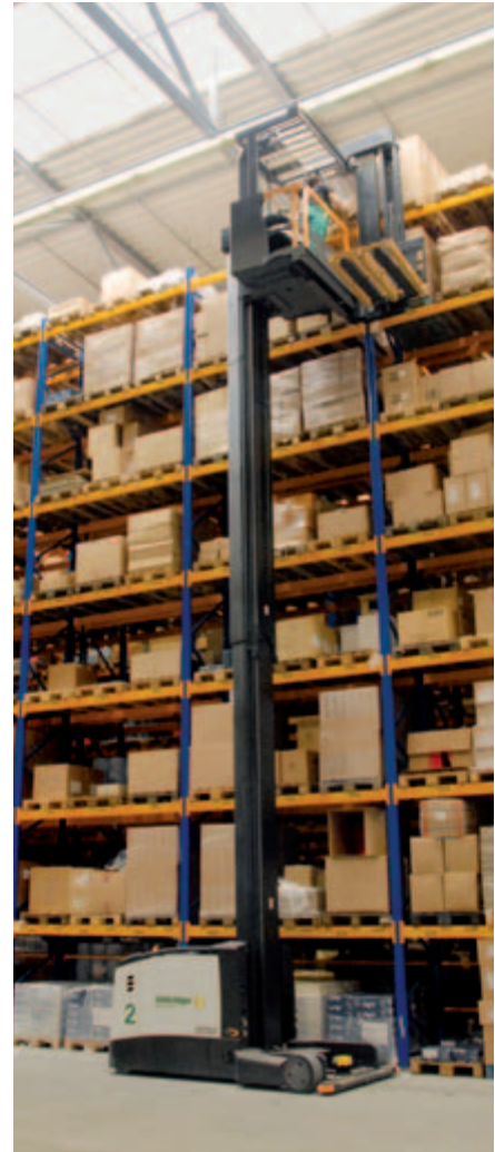
The operator can work safely at all elevations at the same level as the load with fully or partially laden pallets.

Soon, Wollschläger will have 4,800 pallet spaces in its high-bay warehouse instead of the 3,500 pallets currently available. “The TSP truck solution allows us to be optimistic about the future as we will undoubtedly have even more picking orders. Although the new high-bay warehouse hasn’t been up and running for long and we can’t yet state the precise role played by the turret order pickers in our faster turnaround, we do know we’re working far more productively than before,” concludes Jörg Fiedrich.