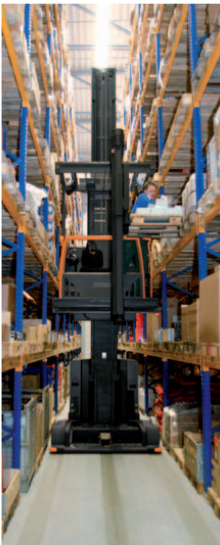
The operator can pick easily items from the rack – there are no controls, accessories or terminals between the operator and the rack or pallet.