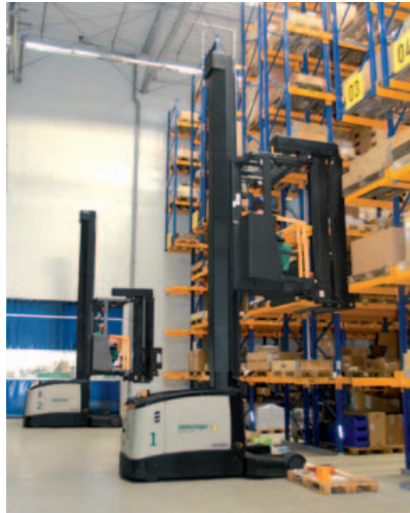
The TSP 6000 are providing superior performance for load handling, travel and acceleration, so that Wollschläger can move more products through the warehouse.

It wasn't only the management of the logistics warehouse that was impressed by the TSP 6000; the staff were also involved in the decision-making process. The TSP 6000's innovative seating concept met with unanimous approval. Crown's exclusive MoveControl™ seat allows operators to choose between various sitting and standing positions and to rotate the seat through 110° in to four positions. Multi-task controls located on cushioned armrests allow the operator plenty of room during picking.