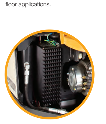
Optional high-frequency chargers are designed for reliable and efficient operation.