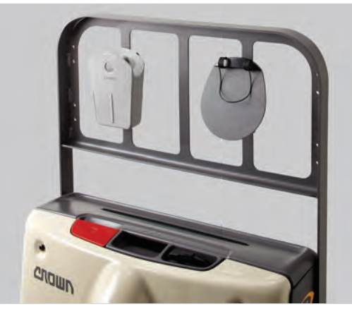
Load Backrest with Work Assist Accessories

The design of the WP 3010 makes it an ideal choice to travel with the lorry. The truck fits exactly in the space remaining at the back of a loaded lorry, or in under-lorry storage boxes. Designed with an operating range of -15°C to 40°C, the WP 3010 can safely stay on the lorry overnight. Long service intervals with minimal maintenance requirements keep it running reliably wherever it goes.