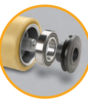
Debris guards prevent stretch wrap, plastic strapping and packing tape from building up around the axle and damaging wheels and bearings.