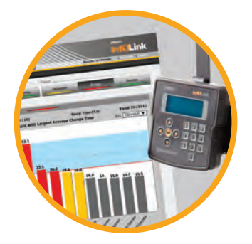
Crown's InfoLink® Fleet Management System offers online access to vital operator/ fleet data.