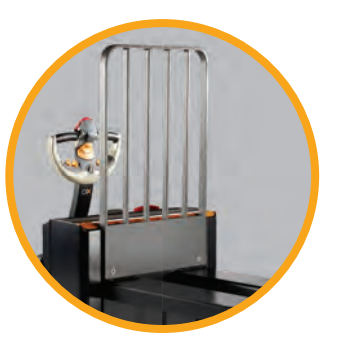
Load backrests (optional) are available in short or high versions to help stabilise loads.