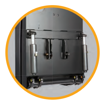
Dual lift cylinders (certain models only) coupled with a heavy-duty torsion bar eliminate chassis twist when handling offset loads.