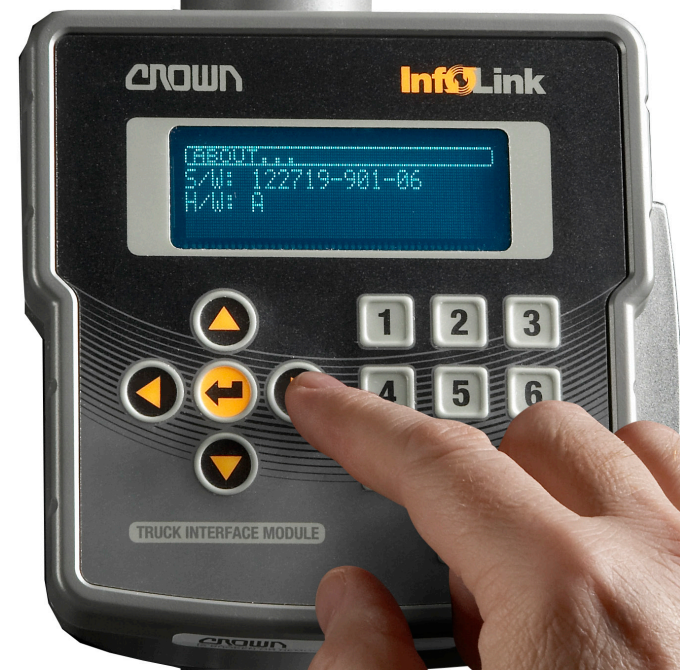
Figure 1. Vehicle-mounted systems benefit both operators and managers.

Whether you choose to begin with real-time information collection or service management, you can expand into a comprehensive fleet and operator management program as organizational resources allow.