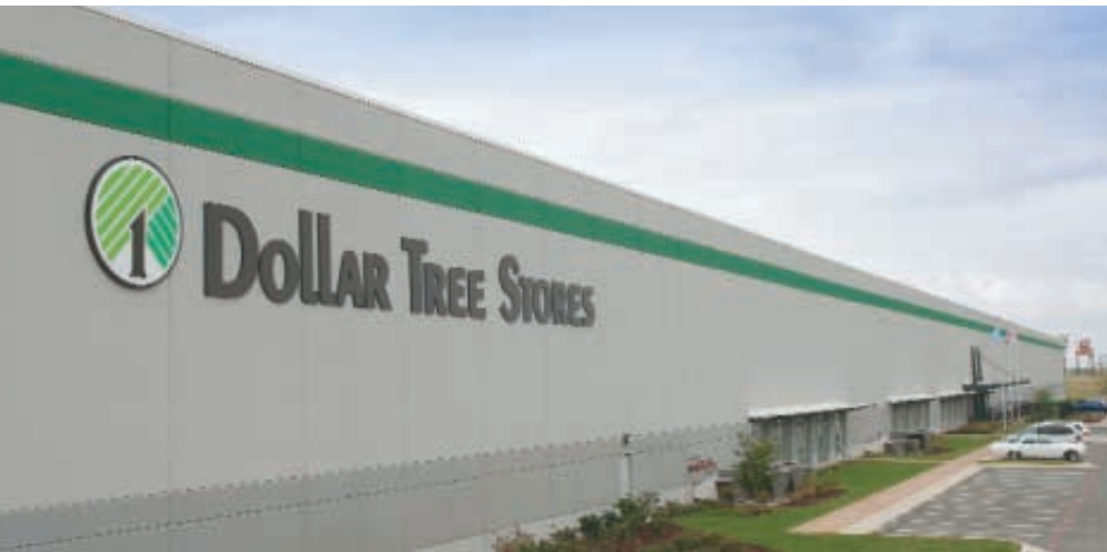
The Marietta, Oklahoma Distribution Center. This 603,000 square foot facility handles products shipped to Dollar Tree Stores in seven states.

Series transport the pallets within the receiving dock for check in and slot assignments. Then PE 3500 Series rider pallet trucks move pallets to drop zones or pick locations.