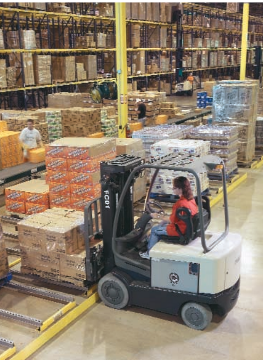
The distribution center handles high-velocity and high-turn products. Quick moving goods like those shown above are headed for an over-the-road trailer with a specific store as a target. Pallets are transferred using a Crown FC 4000 Series lift truck.

“When we build a new facility our expectations are to have the highest level of performance possible of any distribution center operation,” says White, adding the company emphasizes performance, benchmarking and accountability.